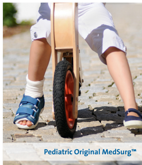
Pediatric Original MedSurg™