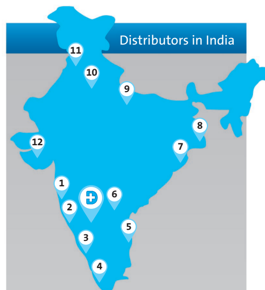
Distributors in India

DARCO products are distributed across India through authorised distributors. For more information on our distributors or obtaining a distributorship, please contact us directly or go to our website: www.darco.in/distributors-india.html